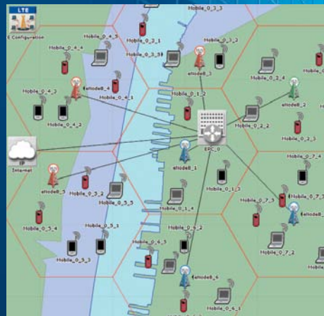
Design and evaluate LTE networks

For more information contact OPNET at LTEcons@opnet.com